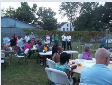
Taking it to the Streets

We continue to keep a special eye on the Ann Hardy Park and the Meadowbridge Corridor. Other patrols include 911 and Taking it to the Streets.